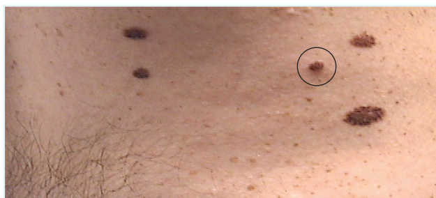
FIGURE 1. Oval brown papule located on the lower right back (inside the black circle).